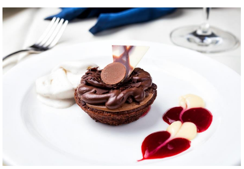
Prices are subject to 22% service fee and state tax

Cole Slaw Cucumber, Tomato, Red Onion Salad Rubbed Ribs, Matouks Habanero Barbeque Sauce Pulled Mojo Pork Bakery Fresh Breads and Rolls Macaroni and Cheese Collard Greens with Smoked Bacon Grilled Corn on the Cob with Chili Butter Pecan Pie, Bourbon Caramel Sauce